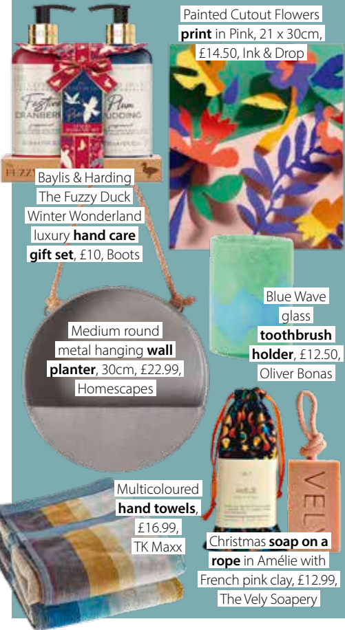
Painted Cutout Flowers print in Pink, 21 x 30cm, £14.50, Ink & Drop