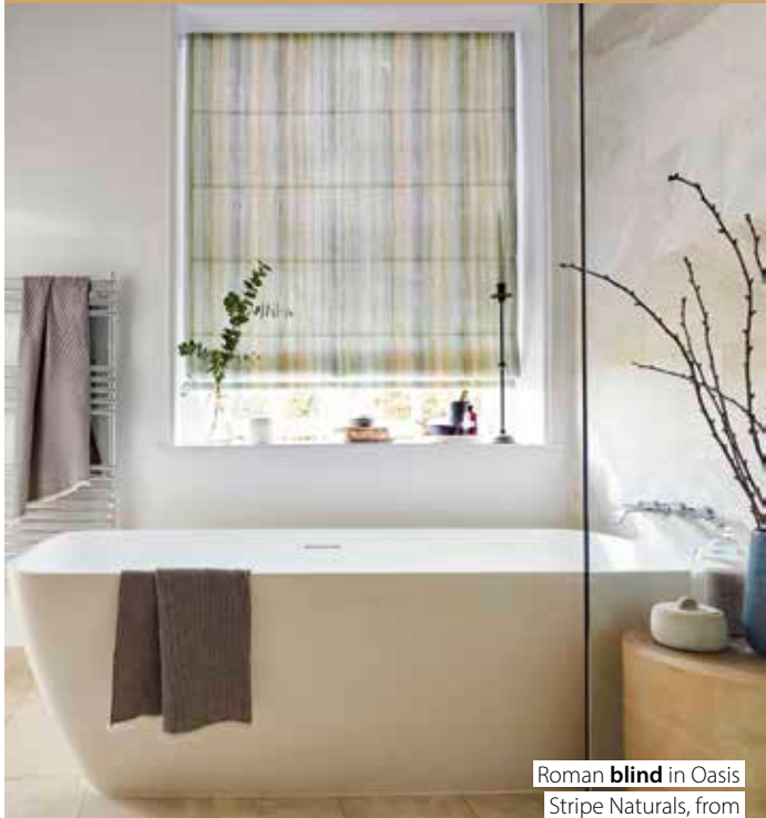
Roman blind in Oasis Stripe Naturals, from £23.55, Blinds 2go

Installing a new window blind may sound like a hassle, but it's a really quick way to give the bathroom a fresh new look and, if you choose a no-drill option, it's even simpler. You can upgrade many designs on Blinds 2go's website – browse the Click2Go options, which don't involve any tools or drilling.