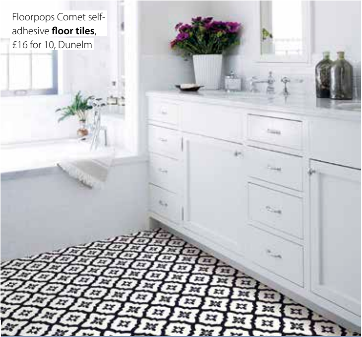
Floorpops Comet self-adhesive floor tiles, £16 for 10, Dunelm